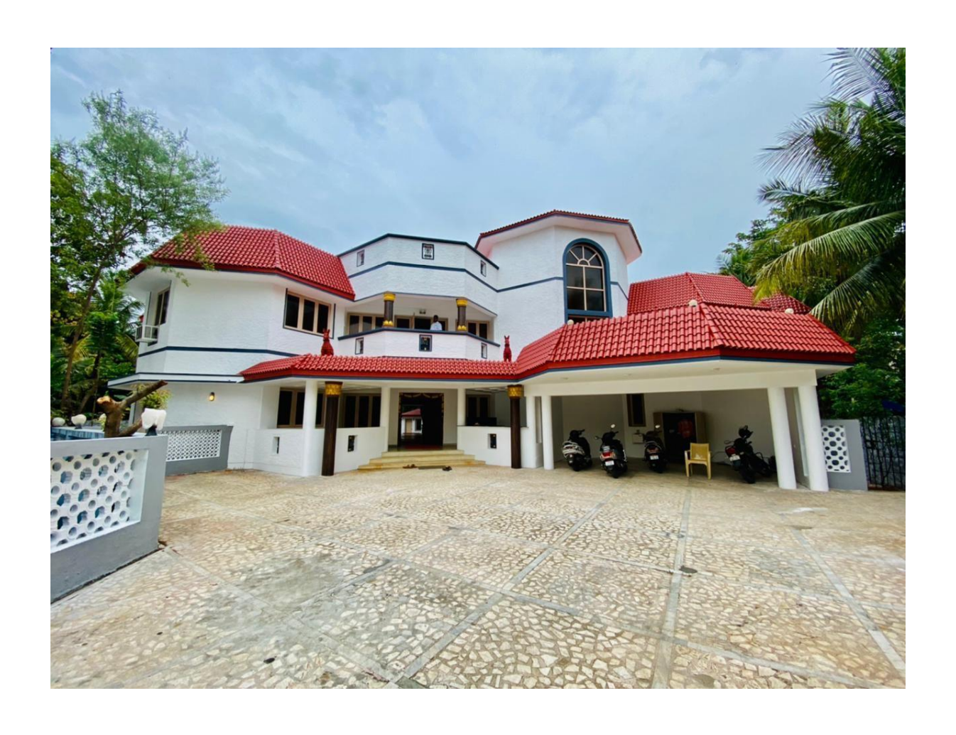
Mock Drill Area