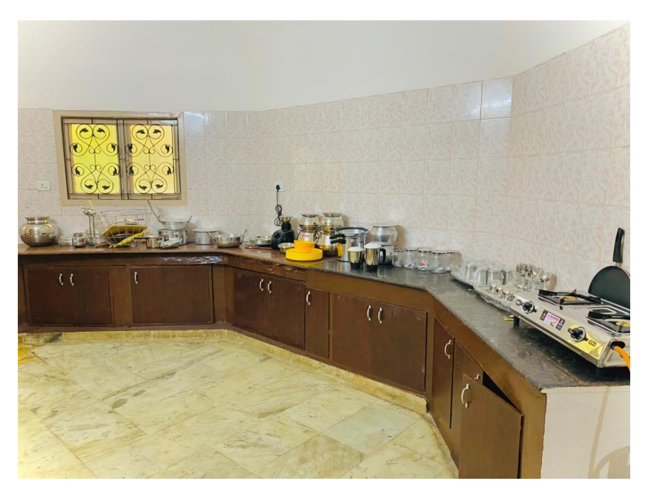
Kitchen and Dinning